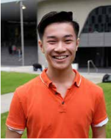
MARKETS CAMPUS CONVENOR