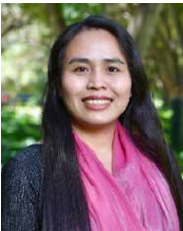
OVERSEAS STUDENTS' OFFICER

So, if you think I am a right person who has confidence, skills and fit for this position to assist in increasing value of your degree go for it.