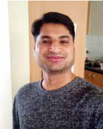
OVERSEAS STUDENTS' OFFICER

It is through empowering students - international and local – that pushes them to a greater strength to make a difference not just in their lives but more importantly for the wider community.